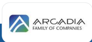
Arcadia Family of Companies