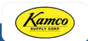
Kamco Supply Corp. of Boston